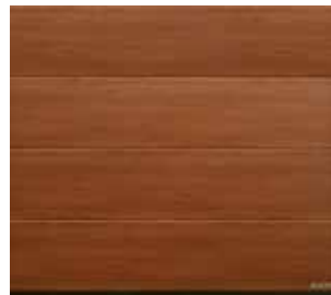
26 Noce Sorrento Balsamico