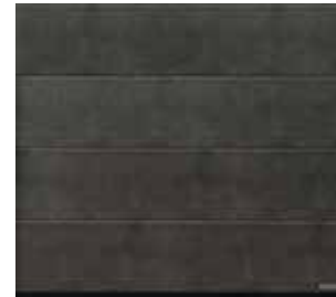
10 Grigio Scuro