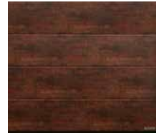
12 Rusty Steel