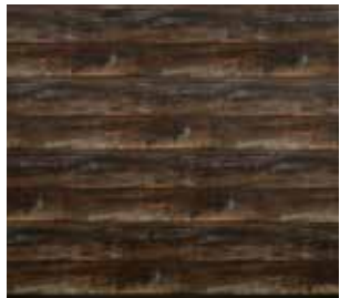
14 Burned Oak