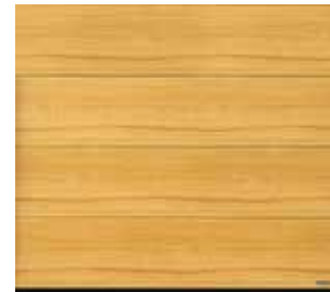
20 Nature Oak