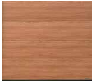
22 Noce Sorrento, plain