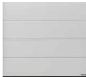
34 White Brushed