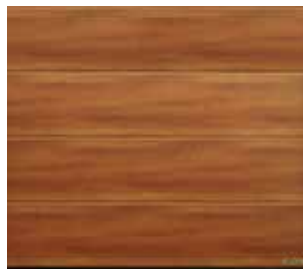
33 Colonial Walnut