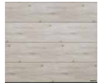
38 Whitewashed Oak