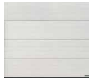
35 White Oak