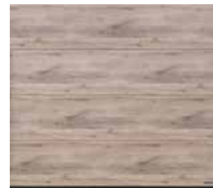
36 White Oiled Oak