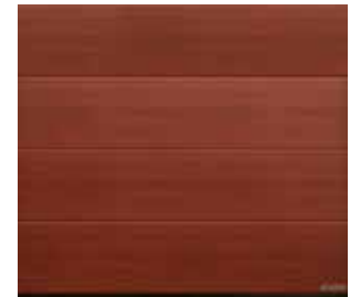
21 Rusty Oak