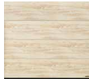
28 Weathered Look