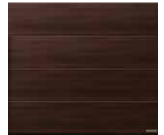
30 Terra Walnut