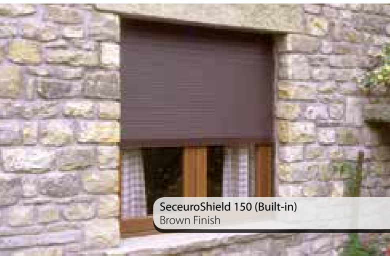
SeceuroShield 150 (Built-in) Brown Finish