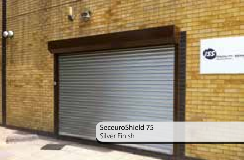
SeceuroShield 75 Silver Finish