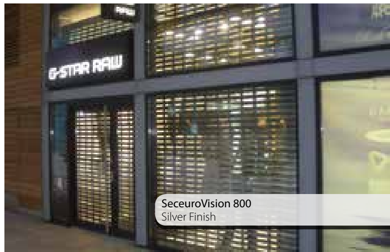
SeceuroVision 800 Silver Finish