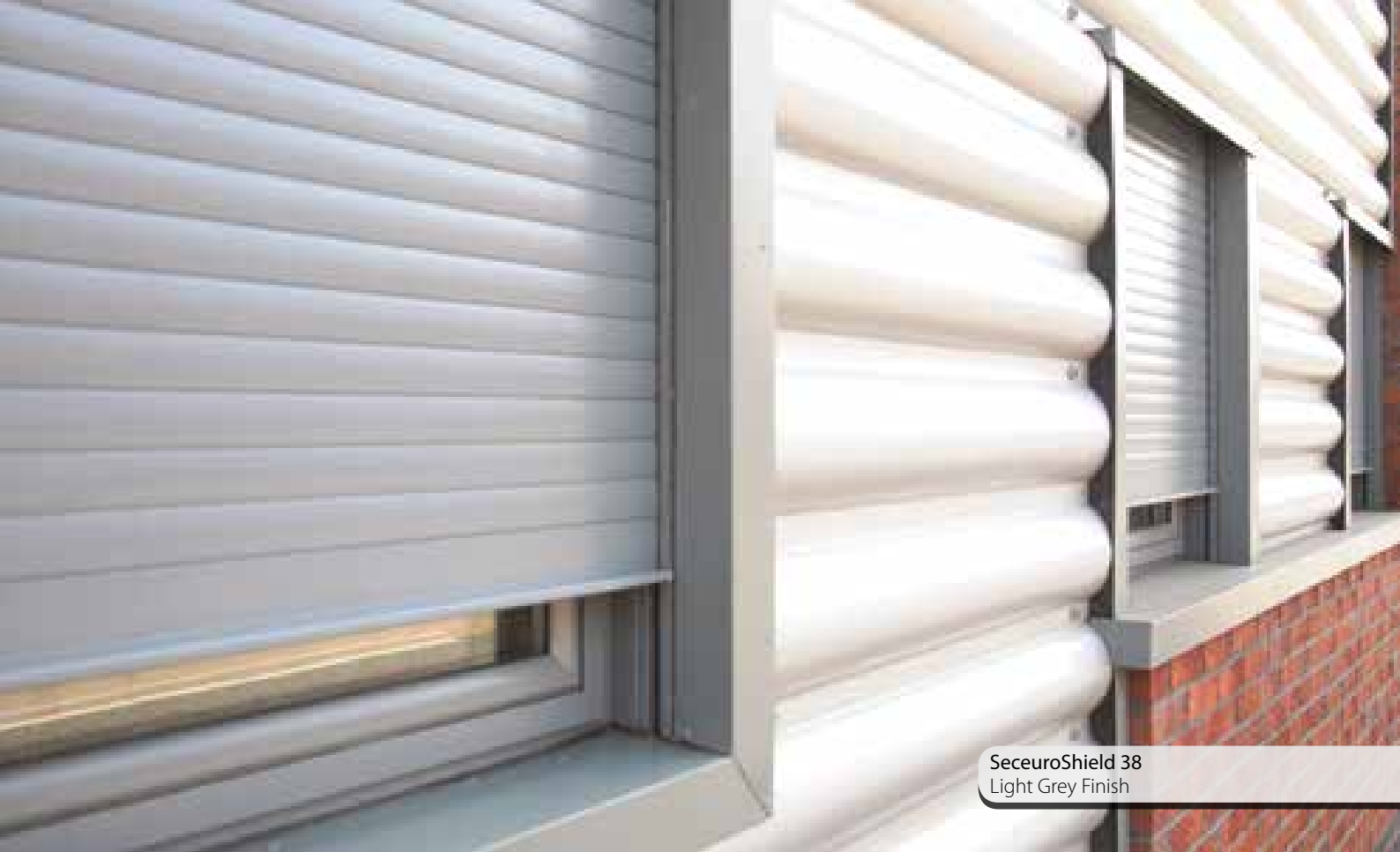
SeceuroShield 38 Light Grey Finish