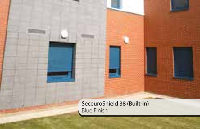
SeceuroShield 38 (Built-in) Blue Finish