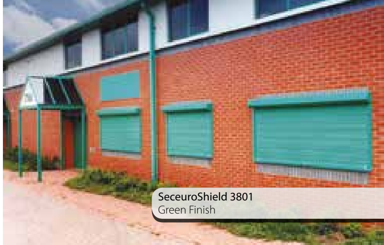
SeceuroShield 3801 Green Finish