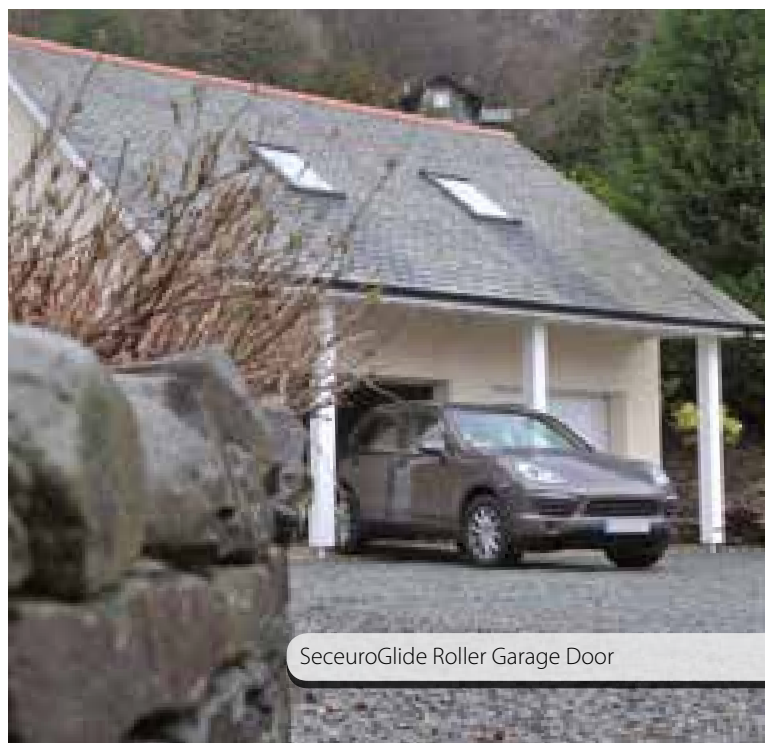
SeceuroGlide Roller Garage Door