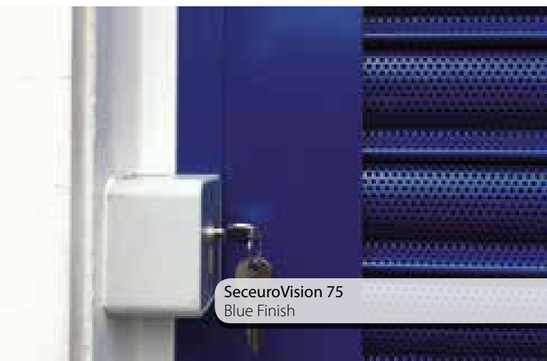
SeceuroVision 75 Blue Finish