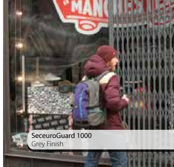
SeceuroGuard 1000 Grey Finish