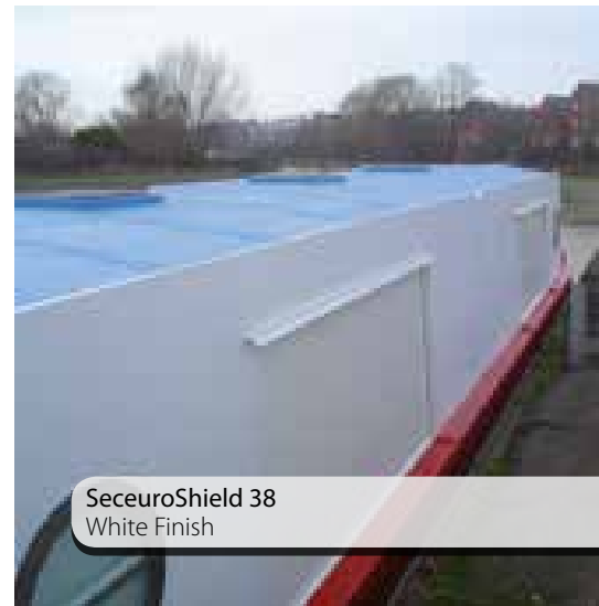
SeceuroShield 38 White Finish