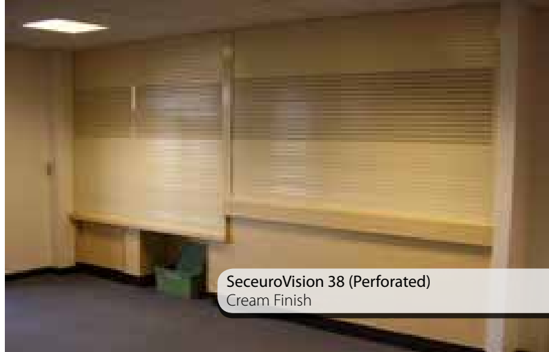
SeceuroVision 38 (Perforated) Cream Finish