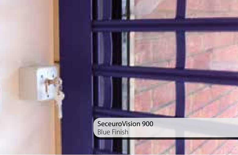
SeceuroVision 900 Blue Finish