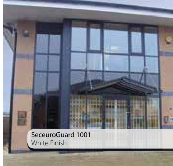
SeceuroGuard 1001 White Finish