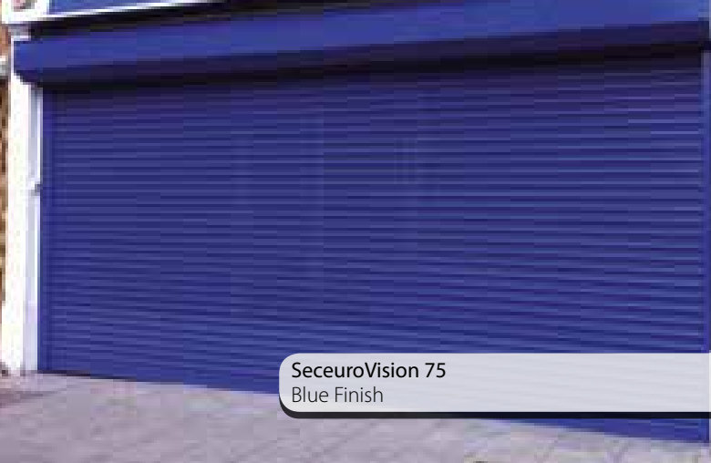
SeceuroVision 75 Blue Finish