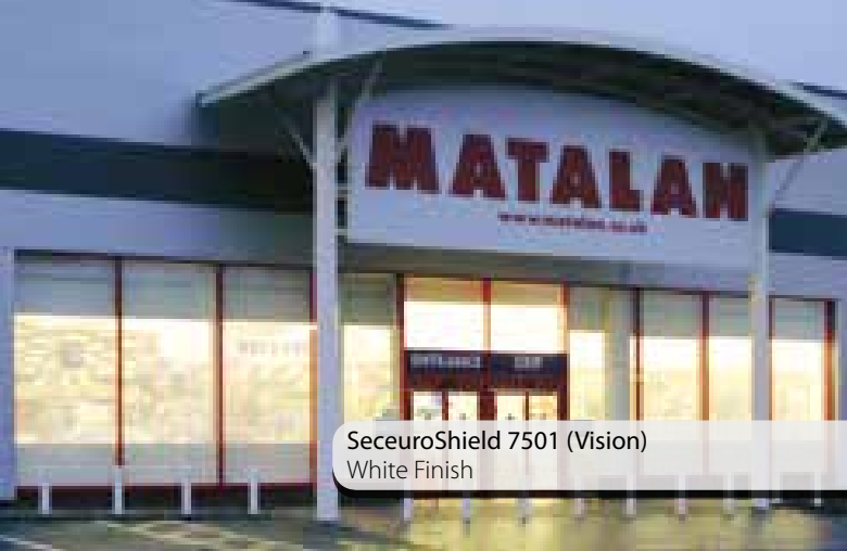
SeceuroShield 7501 (Vision) White Finish