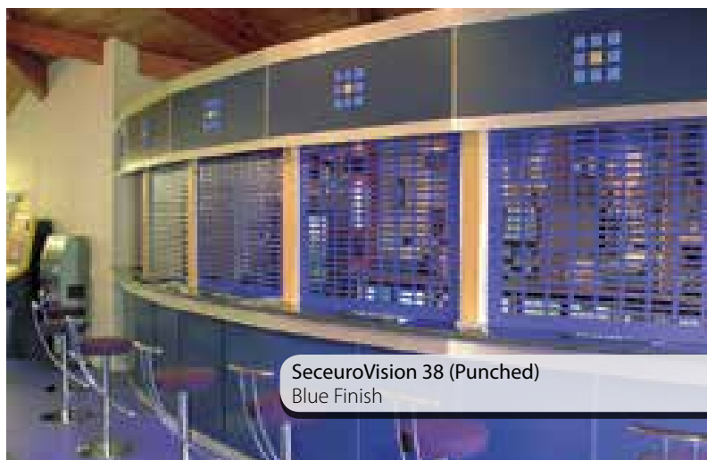
SeceuroVision 38 (Punched) Blue Finish