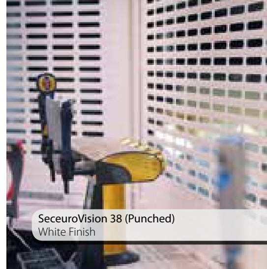
SeceuroVision 38 (Punched) White Finish