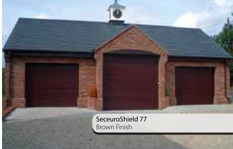
SeceuroShield 77 Brown Finish