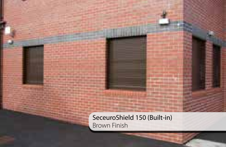
SeceuroShield 150 (Built-in) Brown Finish