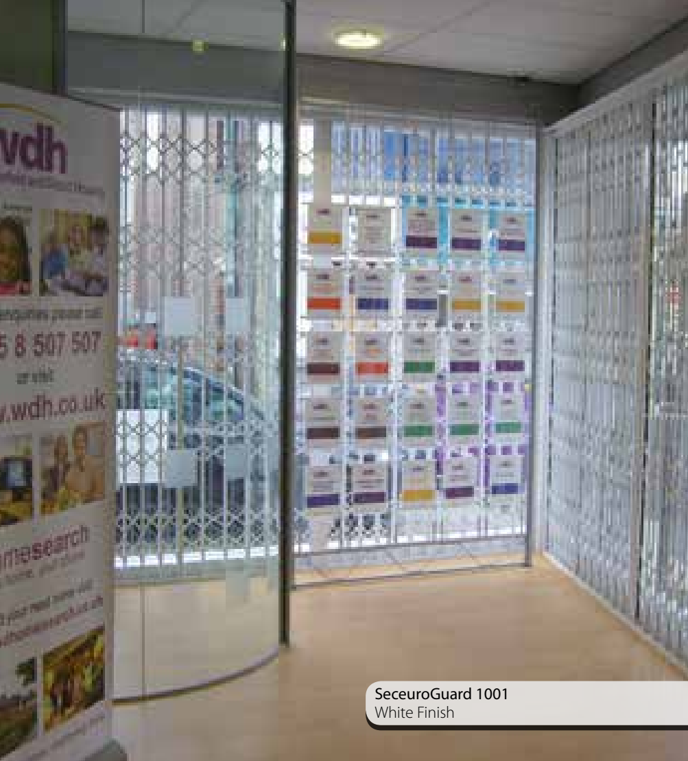
SeceuroGuard 1001 White Finish