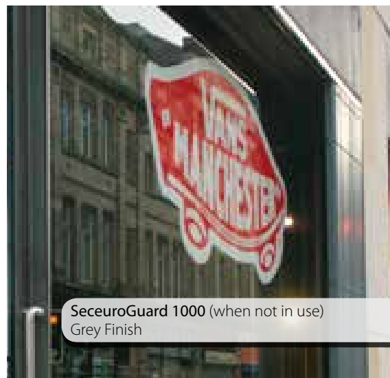
SeceuroGuard 1000 (when not in use) Grey Finish