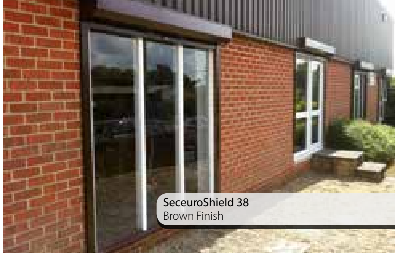
SeceuroShield 38 Brown Finish