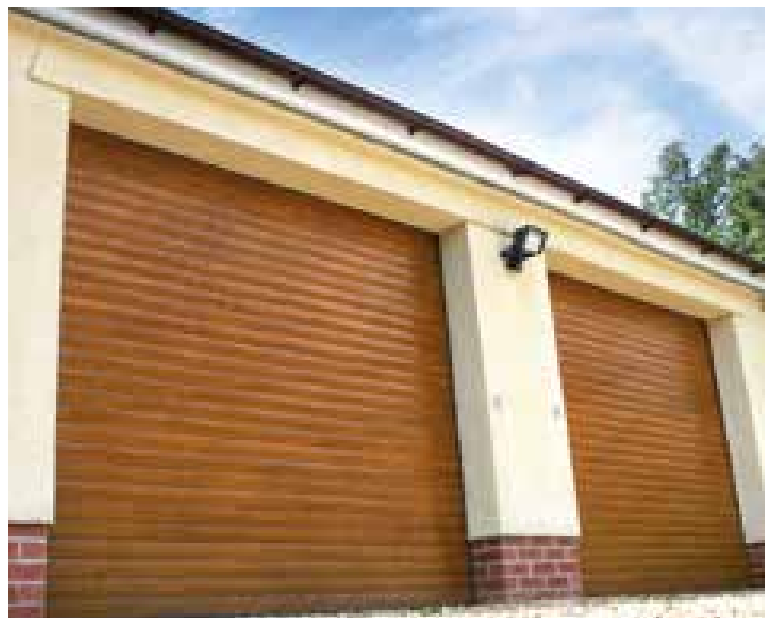
SeceuroGlide Roller Garage Door