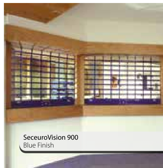
SeceuroVision 900 Blue Finish