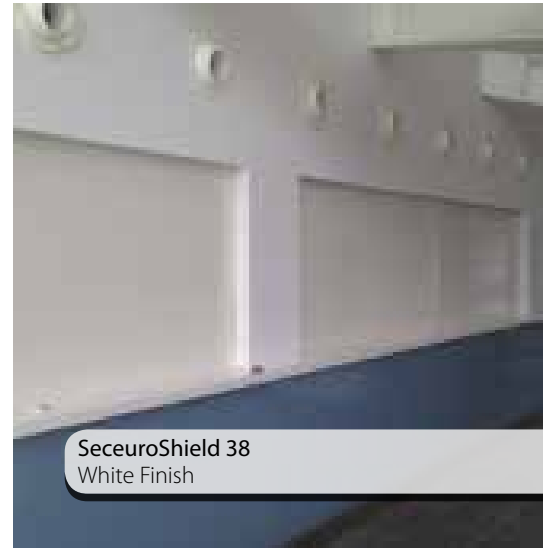
SeceuroShield 38 White Finish