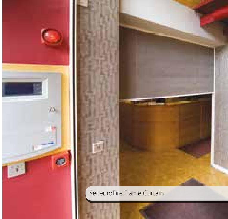
SeceuroFire Flame Curtain

Investing in a SeceuroGlide garage door means you are making the best possible investment in the future of your family's property, both in terms of appearance and security.