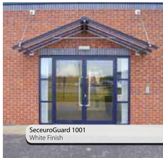
SeceuroGuard 1001 White Finish