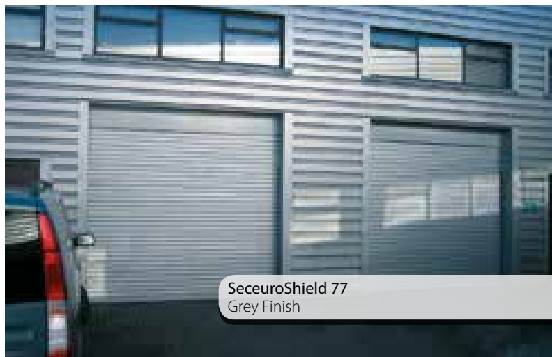
SeceuroShield 77 Grey Finish