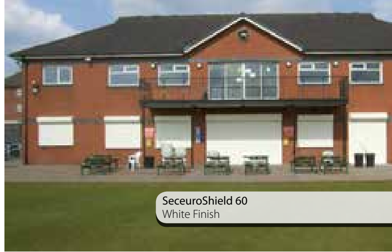
SeceuroShield 60 White Finish