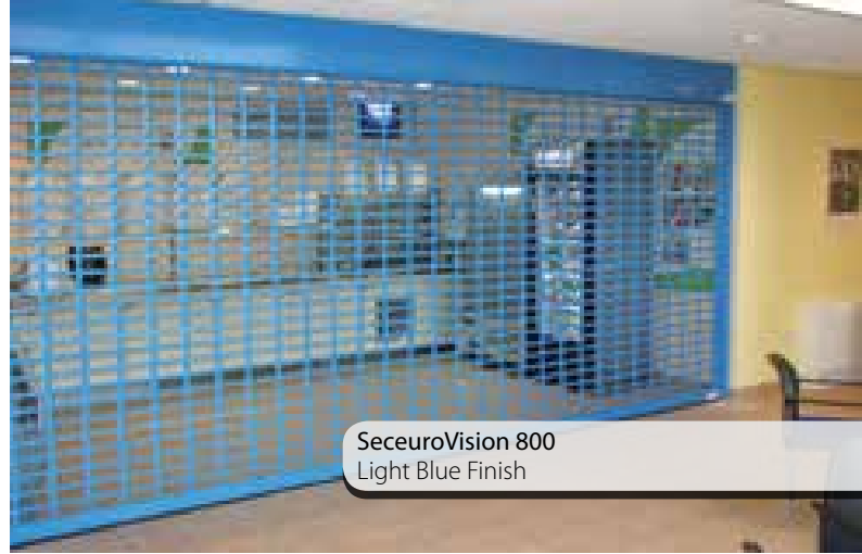
SeceuroVision 800 Light Blue Finish