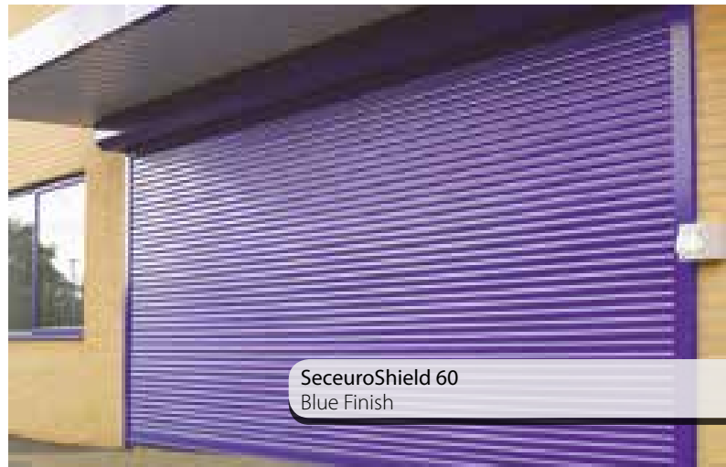
SeceuroShield 60 Blue Finish