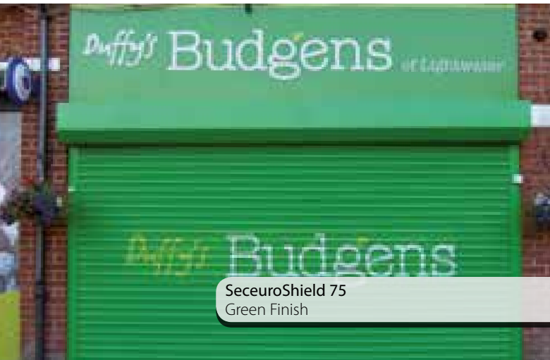
SeceuroShield 75 Green Finish